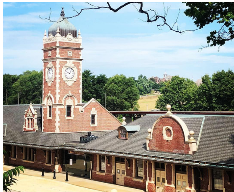
The Greensburg Train Station