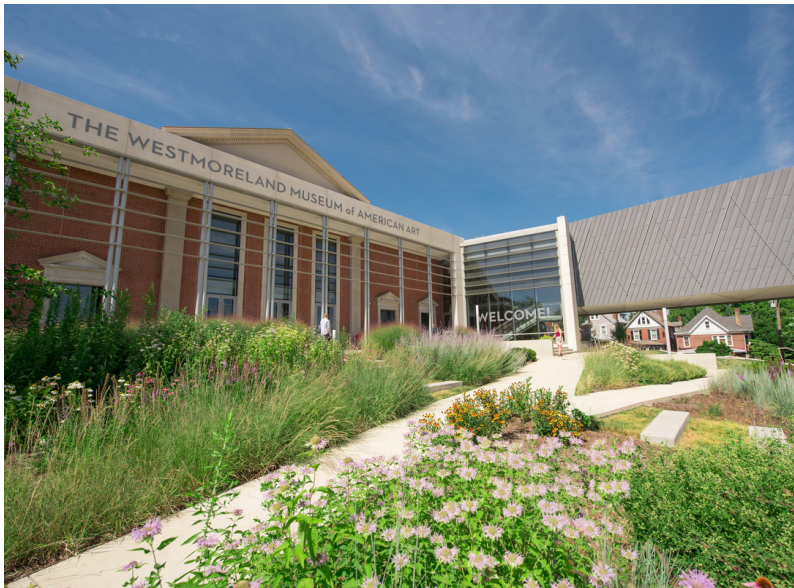
The Westmoreland Museum of American Art

As part of the hotel feasibility study, Tripp Umbach conducted a survey to collect input from tourist populations visiting the Laurel Highlands regions. The following data was collected from that survey and represents evidence to show a possible future increase in hotel demand in Greensburg and the surrounding area.