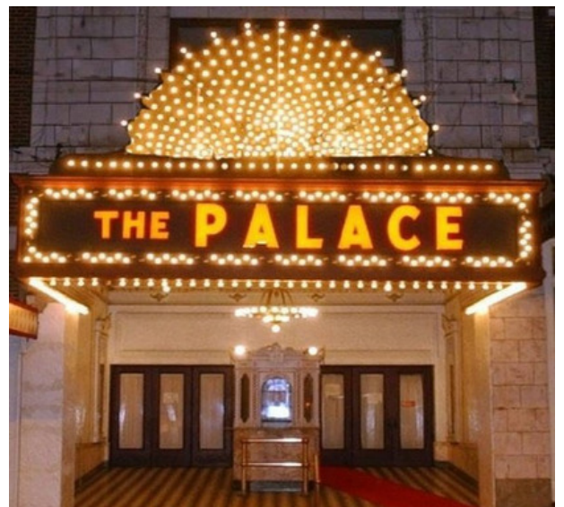
The Palace Theatre