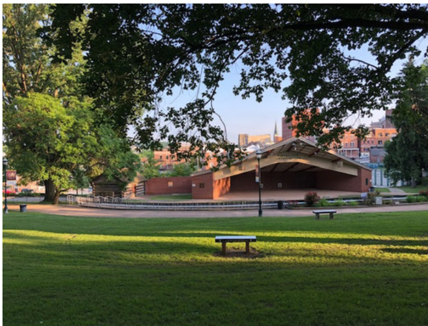
The Robertshaw Amphitheatre in St. Clair Park