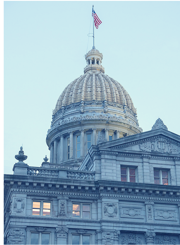
The Westmoreland County Courthouse

Equally important factors making Greensburg a unique place to live are the retail stores of the downtown shopping district and the churches of all faiths. The numerous restaurants and bars located throughout the city make it a fun, unique place to live and are a key part in the popularity of Greensburg. In many ways, Greensburg reflects our society and the region while possessing an appreciation of our history.