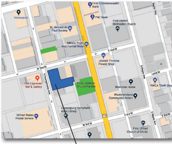
Proposed Hotel Location

Greensburg Community Development Corporation Ashley Kertes | GCDC@thinkgreensburg.com | 724.689.0040 101 Ehalt Street, Suite 111, Greensburg, Pennsylvania 15601